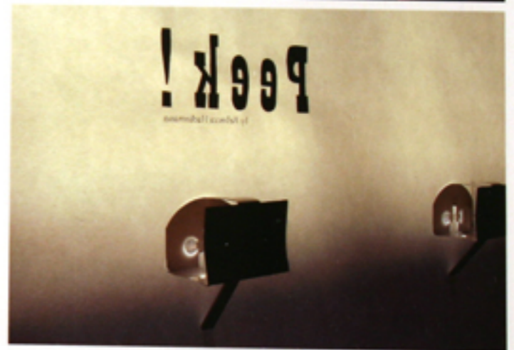
The installation involved the participation of passersby, who had to peer through a peephole to discover the artistic world Hackemann presented. The op-art show featured different 3D illustrations in black and white, accompanied by humorous texts.